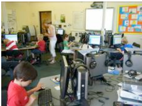
Fronter Champions Club in full swing

Tell us about your recent visit to Olney Middle School