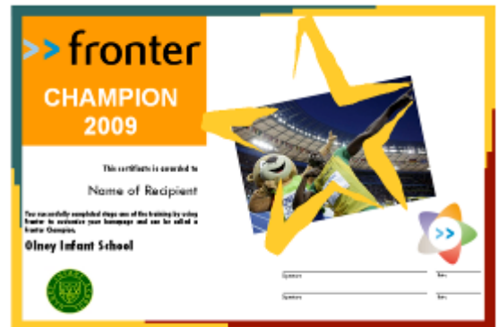
Fronter Champions Certificate

One lunchtime per week we worked together learning new skills